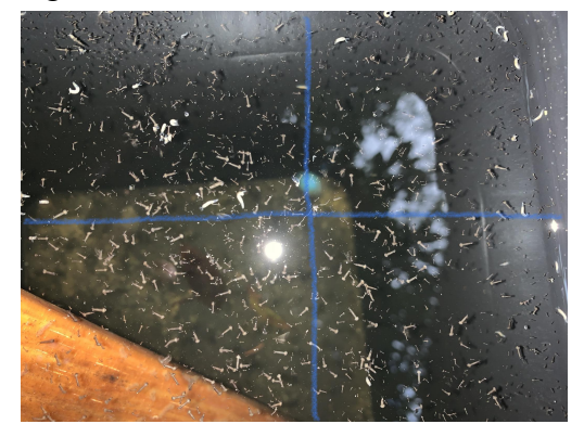
Figure 2: This was a set of 4 sections out of the 16 in the trap

When the larvae were found, looking down on the traps, we took a picture of the larvae. The picture was then split into 16 sections to make counting easier as it was all done by hand (see Figure 2). Once the final count was tallied, we logged into the GLOBE Observer app. Under the Habitat Mapper tab, we reported the land cover, amount of mosquito eggs, larvae (see Figure 3), pupa, and adult mosquitoes found in the trap.