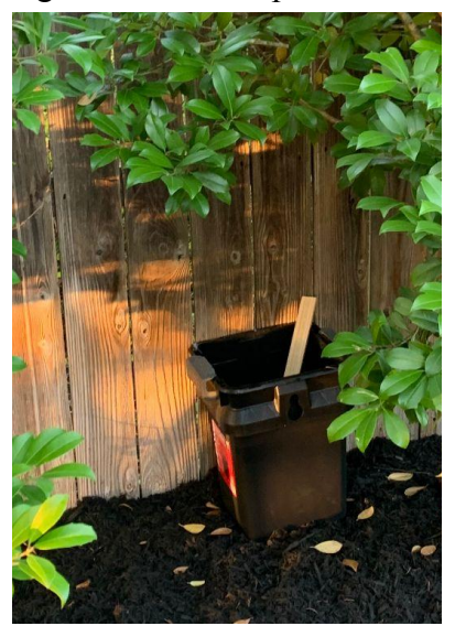
Figure 1: This is a picture of the medium-sized trap (Surface area: 100in<sup>2</sup>) in shade.

When the larvae were found, looking down on the traps, we took a picture of the larvae. The picture was then split into 16 sections to make counting easier as it was all done by hand (see Figure 2). Once the final count was tallied, we logged into the GLOBE Observer app. Under the Habitat Mapper tab, we reported the land cover, amount of mosquito eggs, larvae (see Figure 3), pupa, and adult mosquitoes found in the trap.