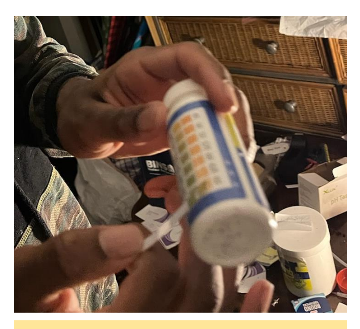
Soil pH was 6.5, too acidic for Raphanus sativus to grow well.

The results did seem to support my hypothesis. This comparison of germination shows that the control germinated at 100% but none of the pharmaceuticals demonstrated such growth. The seedlings were spindly and several of them died. They never gained the greening they needed to produce and photosynthesize. Except for the control seedlings, most of the other seedlings began to shrivel up and die.