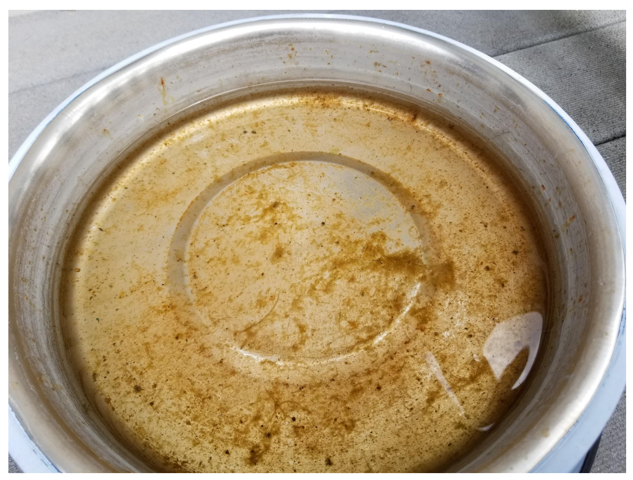
Water dish that my dog uses