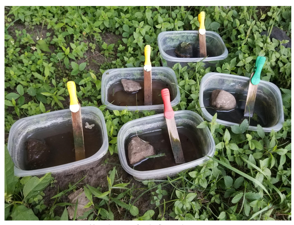
Mosquito traps after the first week

After the first week, I returned to my traps to check for any mosquito larvae, and had found none. Originally, I hypothesized that the lack of larvae was due to the large amount of thunderstorms that had occurred that week. All five of the traps had largely been flooded, and the water had turned to an extremely dark color. In addition to this, there was debris that had fallen into the traps, which also may have warded off mosquitoes. After repeating this setup for the second week, the same results occurred despite the fact that the traps had received no rainfall during the second week.