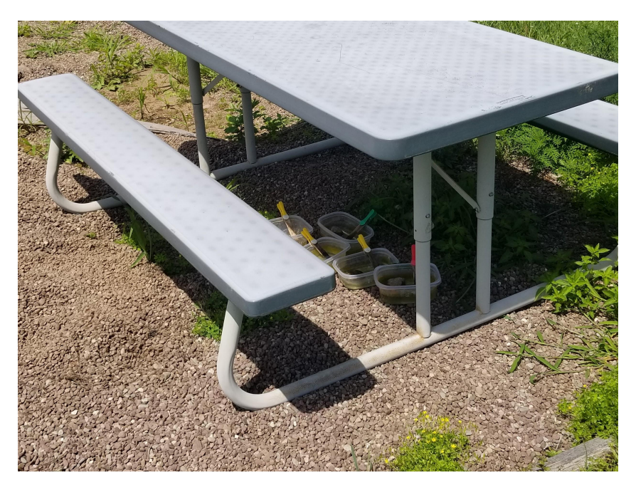
Trap setup for the third week

For week three, I drastically lowered the amount of dog food from ten pieces down to one. In addition to this, I moved the location of the traps to underneath a picnic table in my backyard, as an attempt to shelter them from rainfall that was forecasted to occur. This change in setup was shown to be largely successful, as I found many mosquito larvae at the end of the third week. Additionally, after repeating this setup for the fourth week, I received similar results.