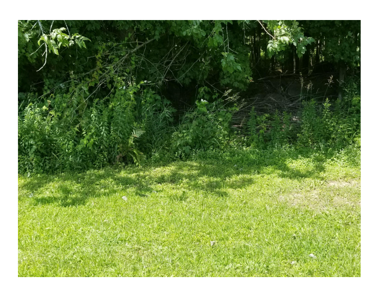
Surrounding area in which the traps were placed