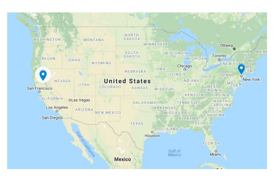
Caption: study site of Paradise, California and Bergen County, New Jersey on Google My Maps

We carried out our plans. CV2 in Python was used to analyze the RGB content and produce the greenness value of satellite images of the Camp Fire from NASA Worldview. We analyzed a baseline pre-fire image, one immediate post-fire image, and 26 weekly post-fire images. We took before and after pictures at three locations in Bergen County, New Jersey through the GLOBE Observer app.