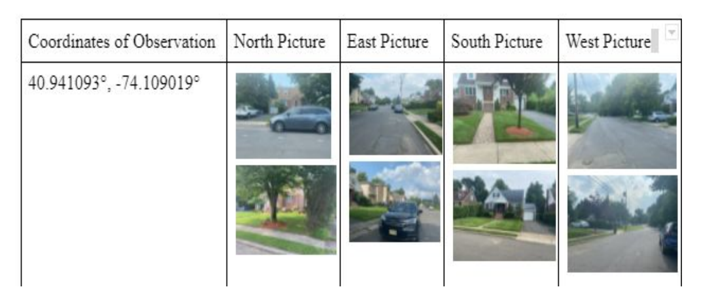
Before (top) and after (bottom) pictures at one location