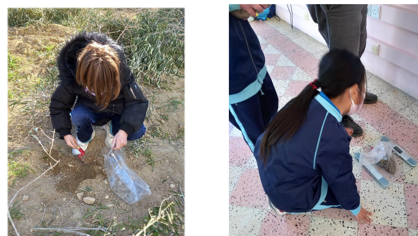
Collecting and weighing soil samples

The Sampling Method followed these steps: once the pupils were briefed, an area was allocated to each pupil. Six pupils were allocated one sampling area each (A, B, C, D, E and F). The pupils used a shovel to remove the soil. Then they put the soil in a sealable plastic bag. Later, each sample was weighed on a digital scale. The pupils used the scales to measure the same amount of soil to pour in the glass jars (around 350 grammes). The sample was later poured in a glass jar after which, water was poured. Each jar was closed tightly with a metal lid and shaken vigorously for two minutes to loosen all the particles contained within it. Then, the jar was placed on the desk of each pupil and left to settle.