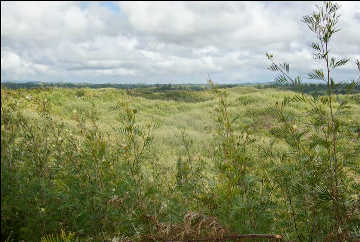
FIGURE 1 - Example of a problematic tree-planting initiative. In the highly degraded but previously mega-diverse lowlands of eastern Madagascar. Large scale reforestation was carried out in the 1980s, covering thousands of hectares with the Australian Grevillea banksia and other non-native species. The initial intention was to provide communities with a source of firewood. This goal met with some success, but there were unintended consequences, such as displacement of croplands and exclusion of native biodiversity.