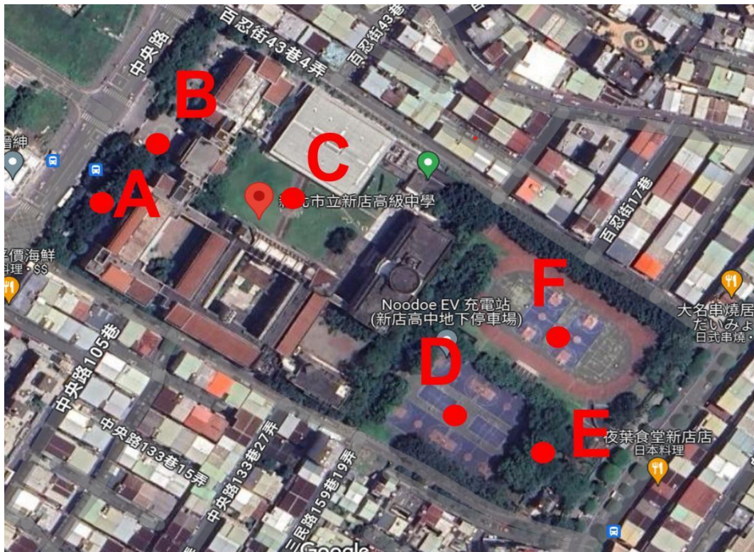
Figure 1: Observation site

highest at point B, followed by points D and F, while the lowest levels are observed at points A, C, and E. This is because point B experiences heavy traffic flow, points D and F have 20 to 30 individuals engaging in physical activity, whereas points A, C, and E are generally devoid of people.