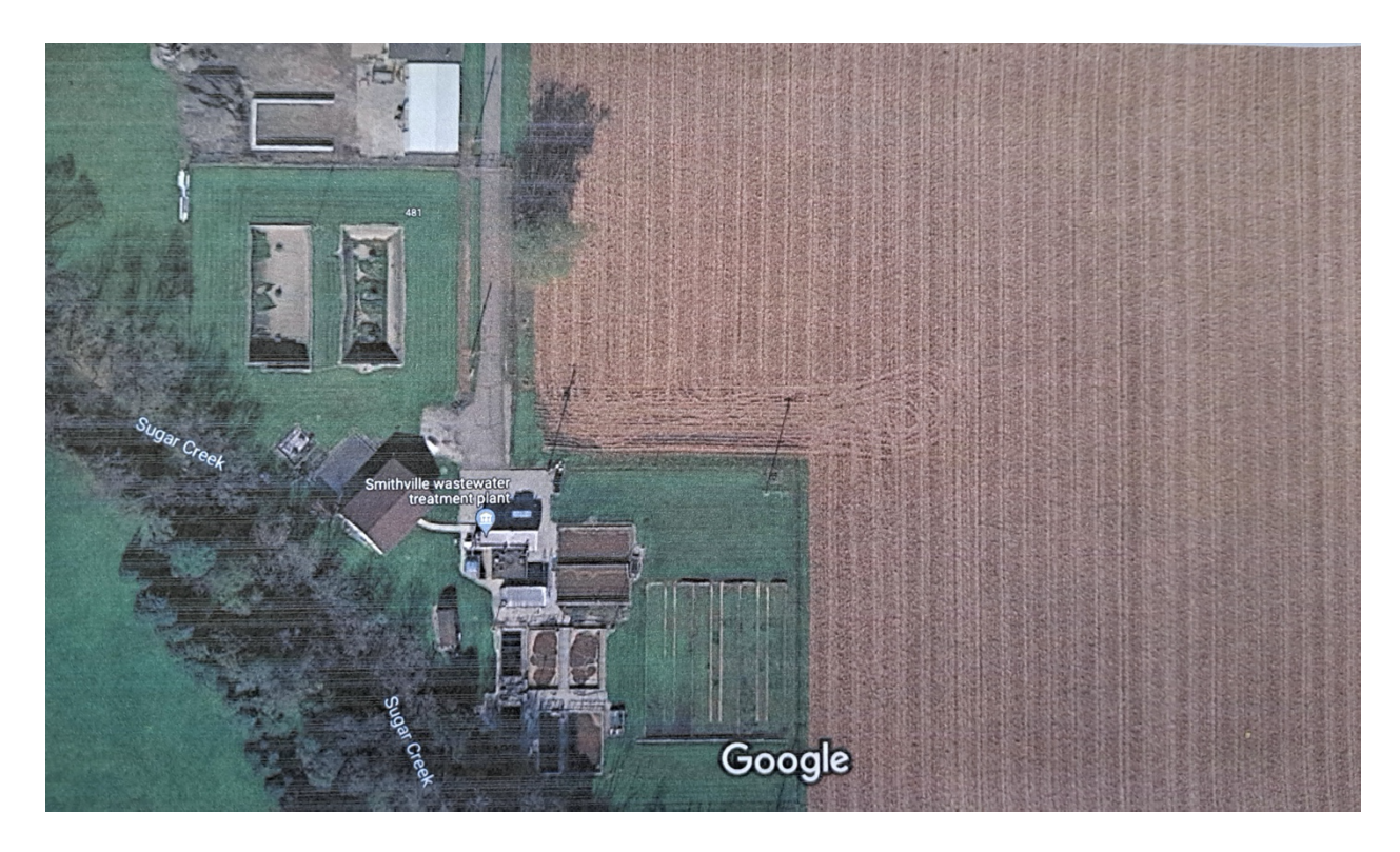
Figure 1. Study Site: Smithville Water Treatment Plant

During my research, the data did not support the hypothesis. The hypothesis was: Water upstream would positively affect the plants while water downstream would affect the plant negatively. During all twenty-one days of testing and observing, nothing really changed, but upstream had ninety-two healthy leaves, nine dead leaves, and thirty-eight withering tips. Downstream had ninety-three healthy leaves, sixteen dead leaves, and thirty-eight withering tips. According to the results, downstream was slightly negatively affected.