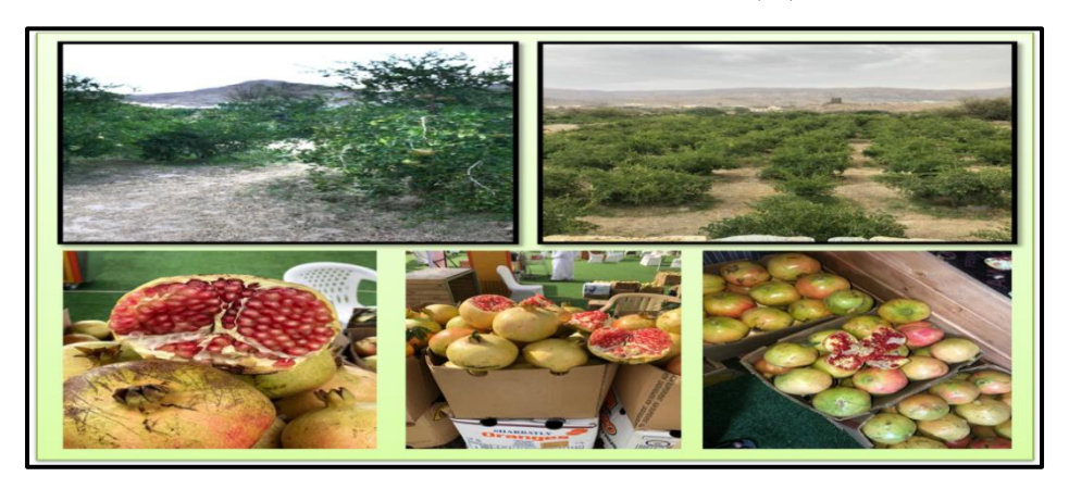
A farm for growing and producing pomegranate fruit in Al-Bahah in Valley Bidah Figure (8)