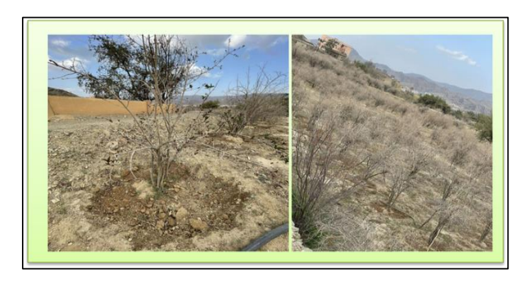
Pomegranate tree in autumn and winter Figure (9)