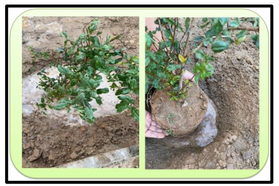
Pomegranate seedlings (Figure 1)