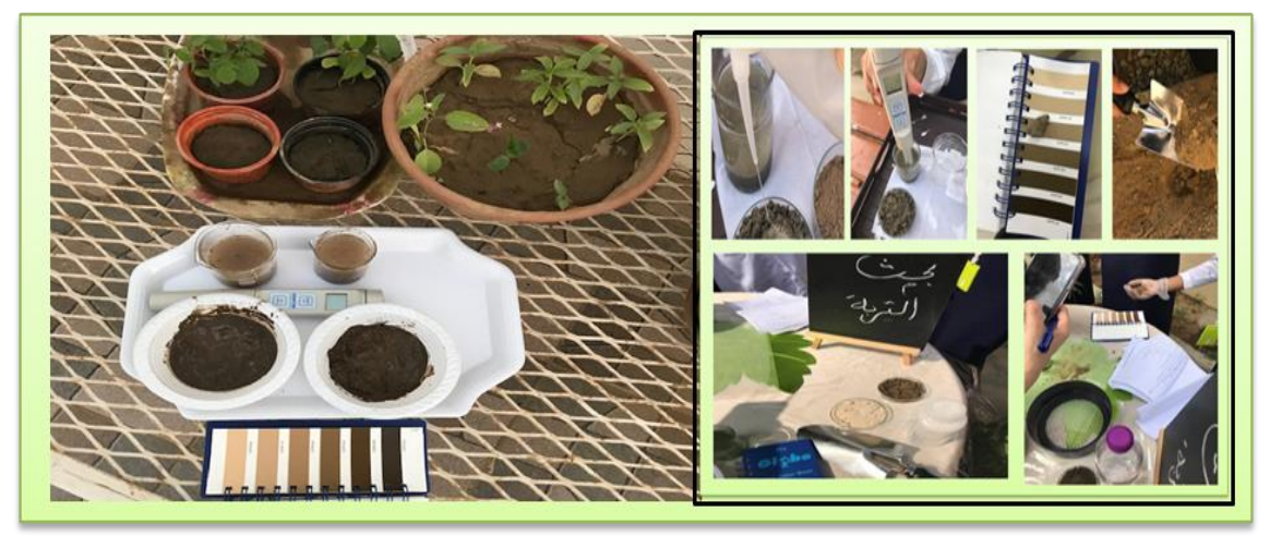
Soil characterization in terms of acidity, bicarbonate, and color, and a comparison between Al-Mattan and Al-Baha soils Figure (6)

-Then the soil was characterized in terms of acidity using a device (ph protocol) and color using the soil and structure color book, and we added vinegar to identify the percentage of carbonate and the soil was sifted to find out the amount of roots and rocks (Figure 6) So we noticed that the soil is alkaline, and there is no bicarbonate. And it contains few roots and rocks. Then we studied the soil of the city of Al-Baha and noticed the difference between them. We found that the percentage of bicarbonate is medium and it contains a high percentage of roots.