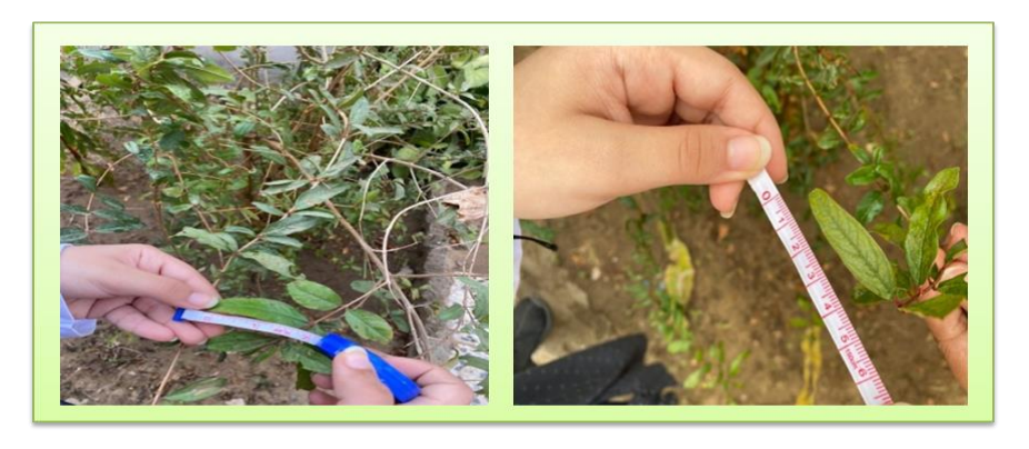
A picture of taking measurements of the length of pomegranate tree leaves, Figure (11)