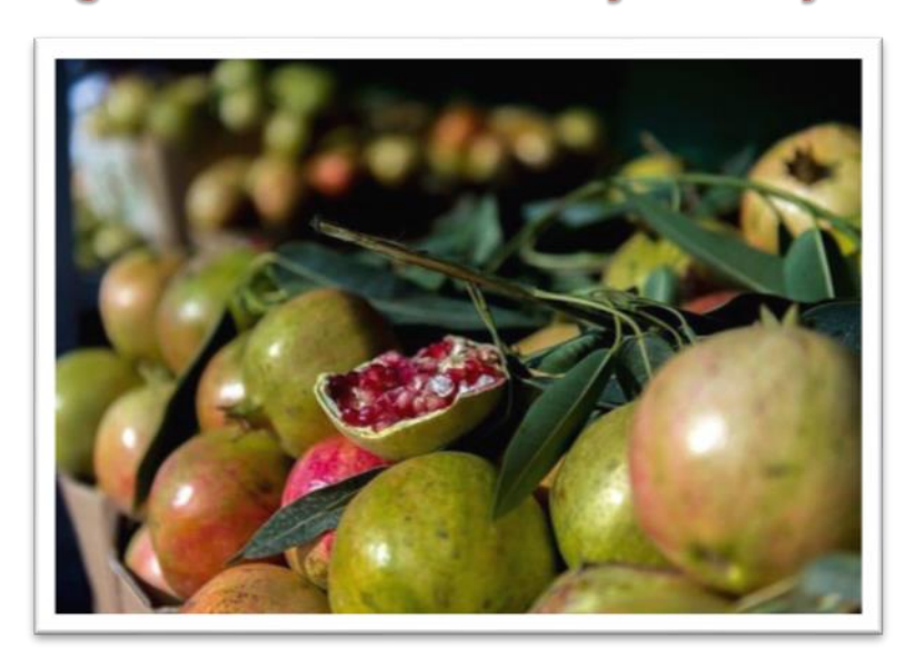
Students names /

The effect of weather and soil on the reproduction of pomegranate fruits in the city of Sabya.