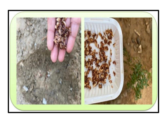
Growing pomegranate seeds figure (2)