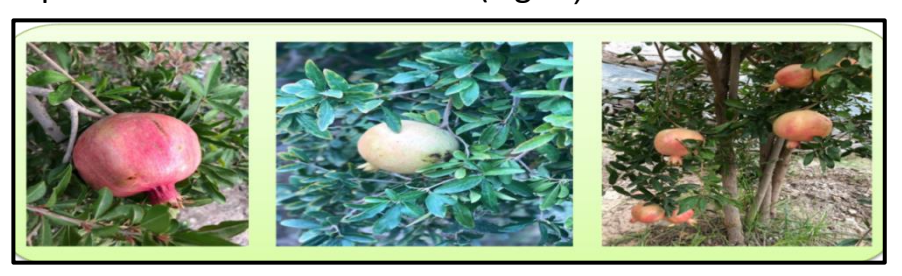
Types of pomegranate (7)

At the conclusion of the interview, she provided us with vivid pictures of their farm in the yard and sold it in shops and markets, Figure No. (8). Pictures of pomegranate plants in autumn and winter (Fig.9)