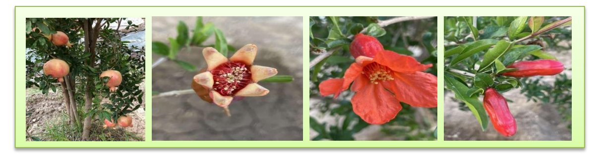
A picture showing tracking the stages of pomegranate fruits appearing in the city of Al-Baha, Figure No. (12)

Data summary: analysis of tables and charts taken from Globe schools.