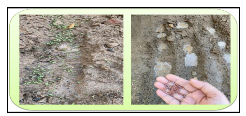
Planting the seeds of other plants in the same soil and their emergence in two days (Figure 3).

- After our participation in the Global Symposium on Virtual Science 2021, we benefited from the comments of the judge that he mentioned to us, including that the cold climate in winter does not allow the cultivation of pomegranate. Among what he mentioned is that pomegranate seeds are a very light plant, and