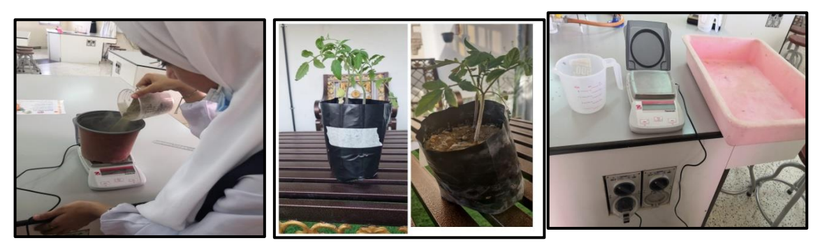
Pictures(5),(6)and(7)shows the application of activities on tomato plants in the school garden

The first question data was collected by measuring the growth of the tomato plant in the school garden. All two vessels were irrigated with the same amount and type of water, same number of tomato seeds were planted, same amount and type of soil was added ,same amount of light was received except that one of them was added to it iron rust solution as a liquid fertilizer and the other was not added to it solution. After that we compared the plant growth by observation and write there growth in notes every six days.