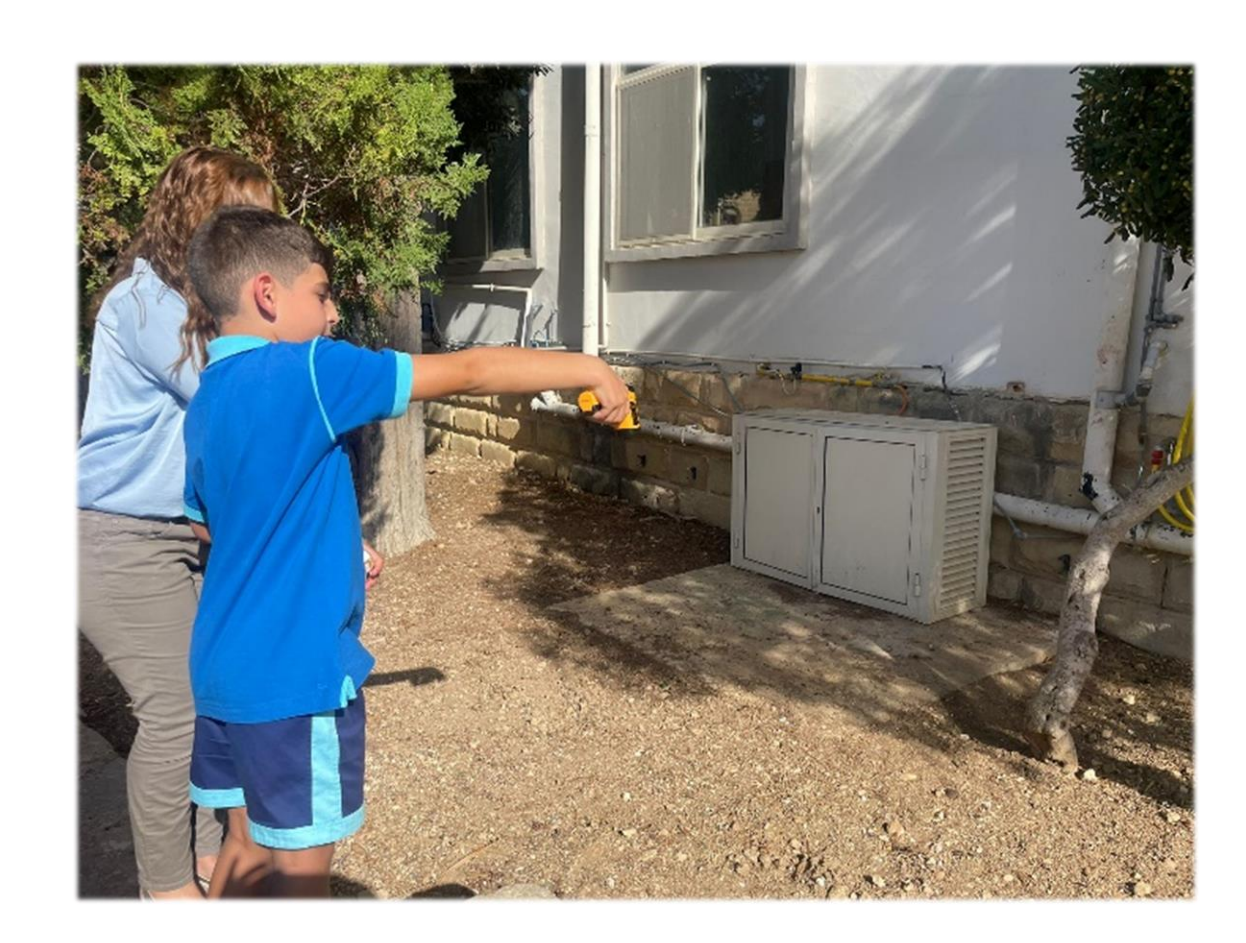
GLOBE students measuring weather parameters using a data logger and soil temperature using an IRT