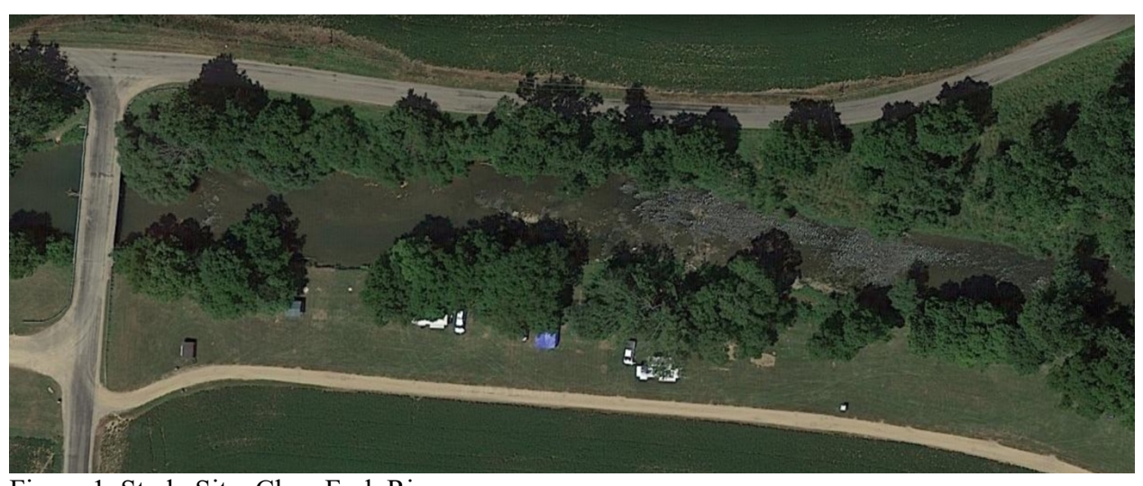
Figure 1. Study Site: Clear Fork River

Description of the Study Site: I found out there were 68 trees along the bank of the Clear Fork River, where I put the leaf packs. (1 box elder, 48 American elms, 9 walnuts, 8 cherry trees, 1 sugar maple, 1 weeping willow.) There were a lot of black walnuts lying around and I rolled my ankle and there were a lot of little divots in the ground. I asked a camper about the little divots in