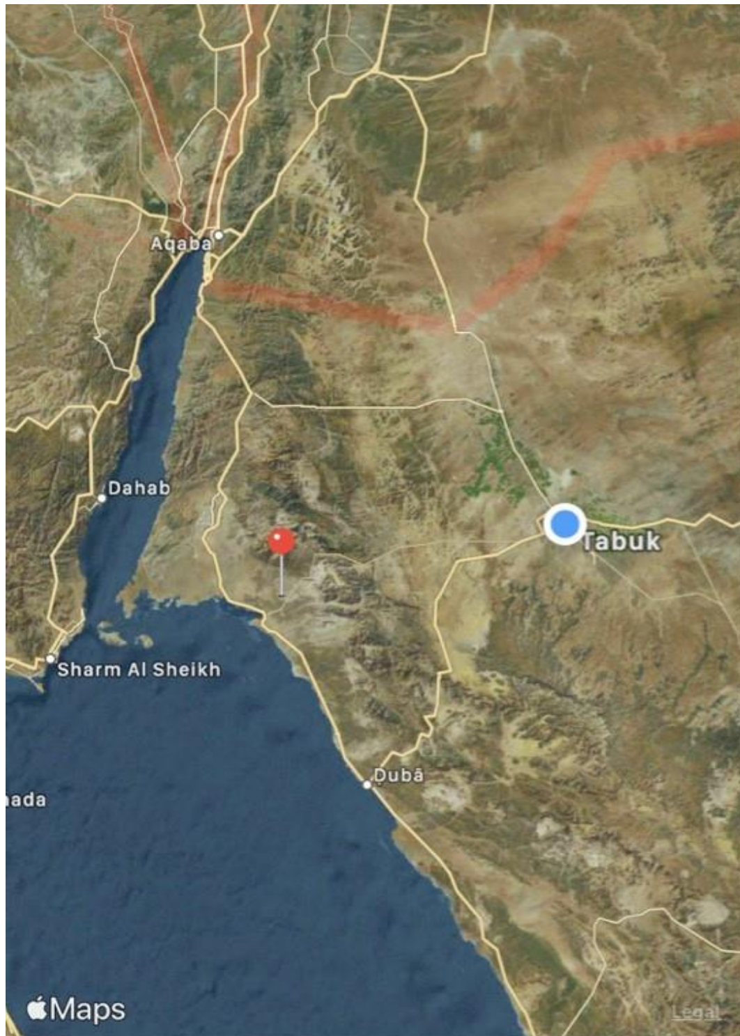
Figure # 2 Geographical location of Sharma coast