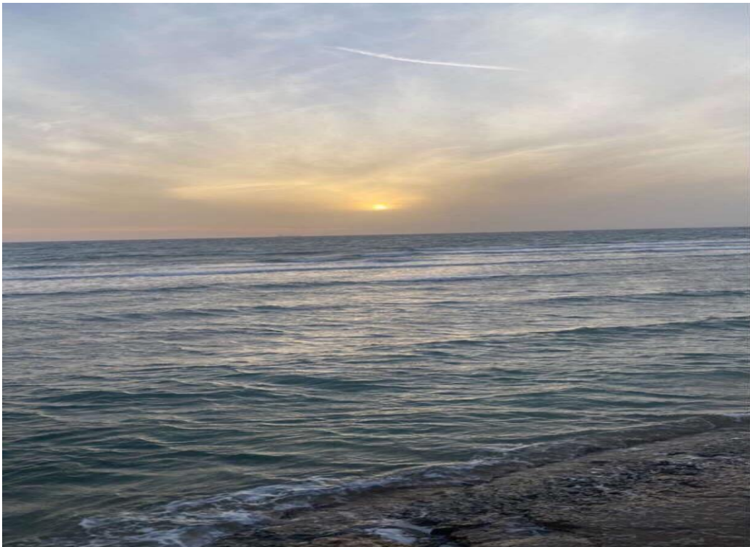
Figure # 1 Sharma Coast, the heart of NEOM project

Sharma, the heart of the next NEOM project, is located on the Red Sea coast in Tabuk region northwest of Saudi Arabia, 130 km away from the city of Tabuk. The main objective of this study is to assess the physical properties of the soil and the water of Sharma coast by examining samples of water and soil using the tools provided with Globe program. The results of the physical and chemical analysis of the water samples confirmed that the water was not contaminated with nitrites or nitrates. In general, it is possible to deduct the water and soil properties of Sharma coast, the heart of the next NEOM project.