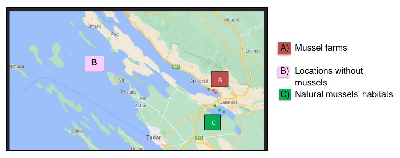
Figure 1 Sampling sites on the coast of Croatia