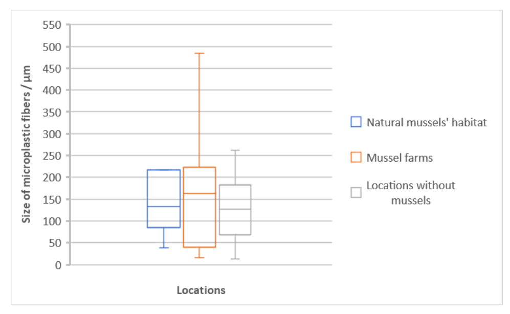
Figure 6 Microplastic fibers size comparation

Further analysis using the ANOVA test revealed a significant difference in the sizes of microplastic fragments (F = 10.59, p < 0.0001). The Tukey HSD post hoc test shows significant differences between the fragment sizes of all three locations, it was determined that p < 0.0001 for all.