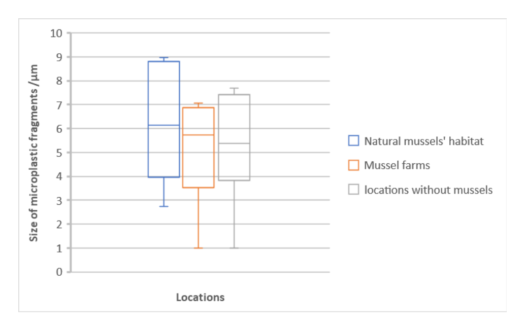
Figure 5 Microplastic fragments size comparation

The analysis of microplastic fragments size is shown in Figure 5. The fragments from each type of location are of similar proportions, but the largest spread of data around the average is shown by the wild mussel areas and the largest deviation by the mussel farm.