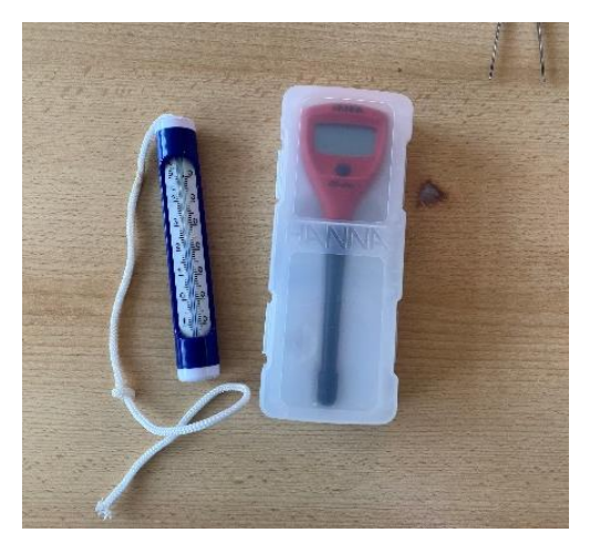
Figure 2 pH meter and termometar