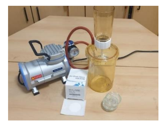
Figure 3 Vacuum filtration equipment