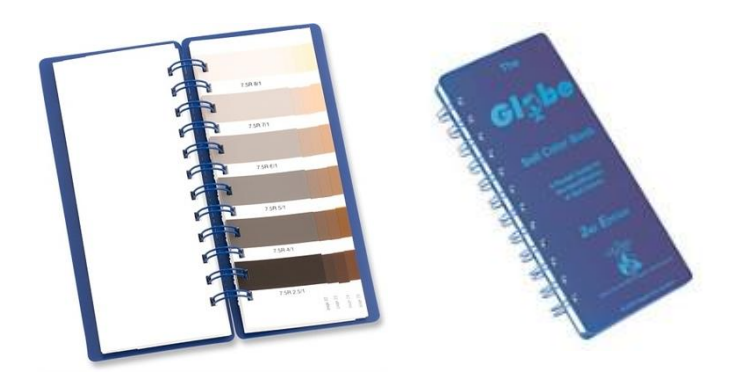
Figure (3): Book of soil colors