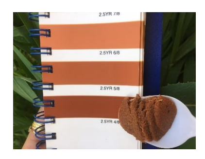
Figure 11: Soil color experience