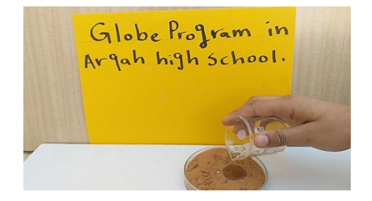
Figure 10: The experience of measuring the soil alkaline protocol.