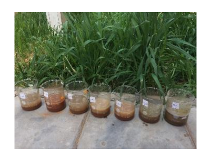
Figure 8: The experience of pH measurement of soil (from experiments we conclude that the soil types are acidic or alkaline (figure 9).