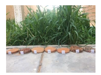
Figure 7: Soil samples in various regions of Saudi Arabia

As we all know. There is a relationship between the acidity of the soil and the amount of bicarbonate in it and the growth of vegetation cover on it when we conducted the experiment, we noticed that if the soil acidity is high, the area is week in the vegetation and the area is difficult to live and is not suitable for agriculture and must be fertilized to give it the missing elements. In addition, sand is spend in highly saline areas, where salinity is high, sodium ions are high deforestation increased, and to reclaim it, organic fertilizer and clay must be added to be cultivable fertile land (figure 8).