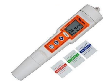
Figure (1) Digital soil pH meter

During the period of (August 2021 to March 2022) and we noticed the relationship between acidity in the soil and the amount of bicarbonate and the rate of growth of plants in those types of soil, To take measurements We used the digital soil pH meter instrument to measure ph (ph Protocol) (Figure1)