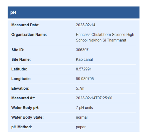
Figure 4. Screenshot of water pH measurement result submissions