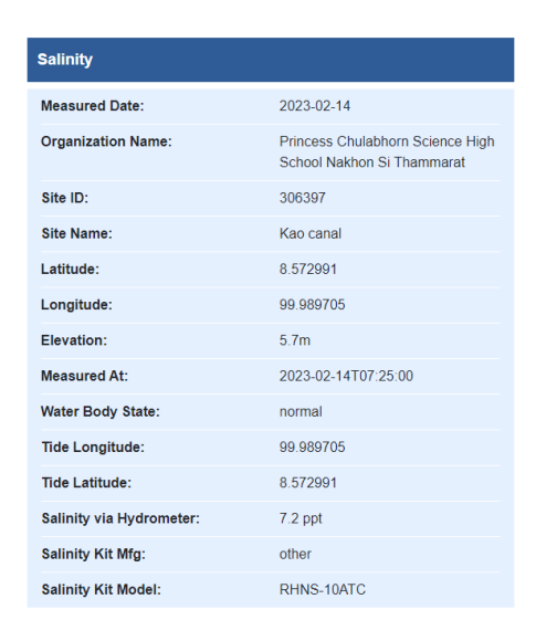
Figure 5. Screenshot of water salinity measurement result submissions