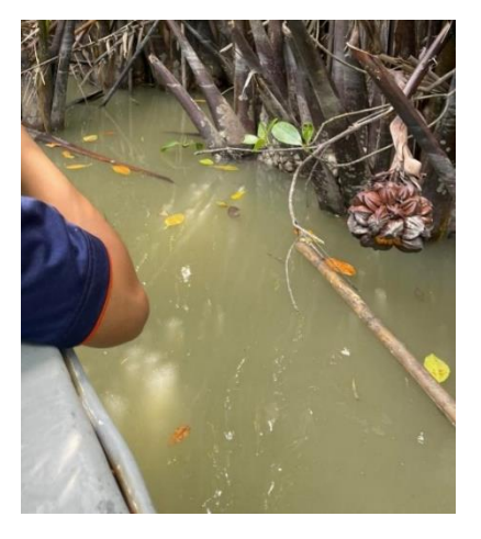
Figure 2. the environment of station 2