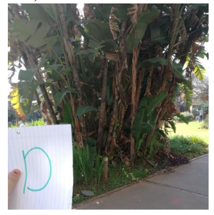
Figure 4: Point D towards Centre E