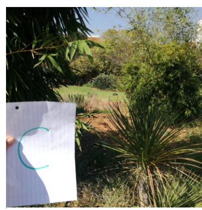
Figure 3: Point C towards Centre E