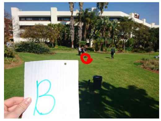
Figure 2: Point B towards the Centre E