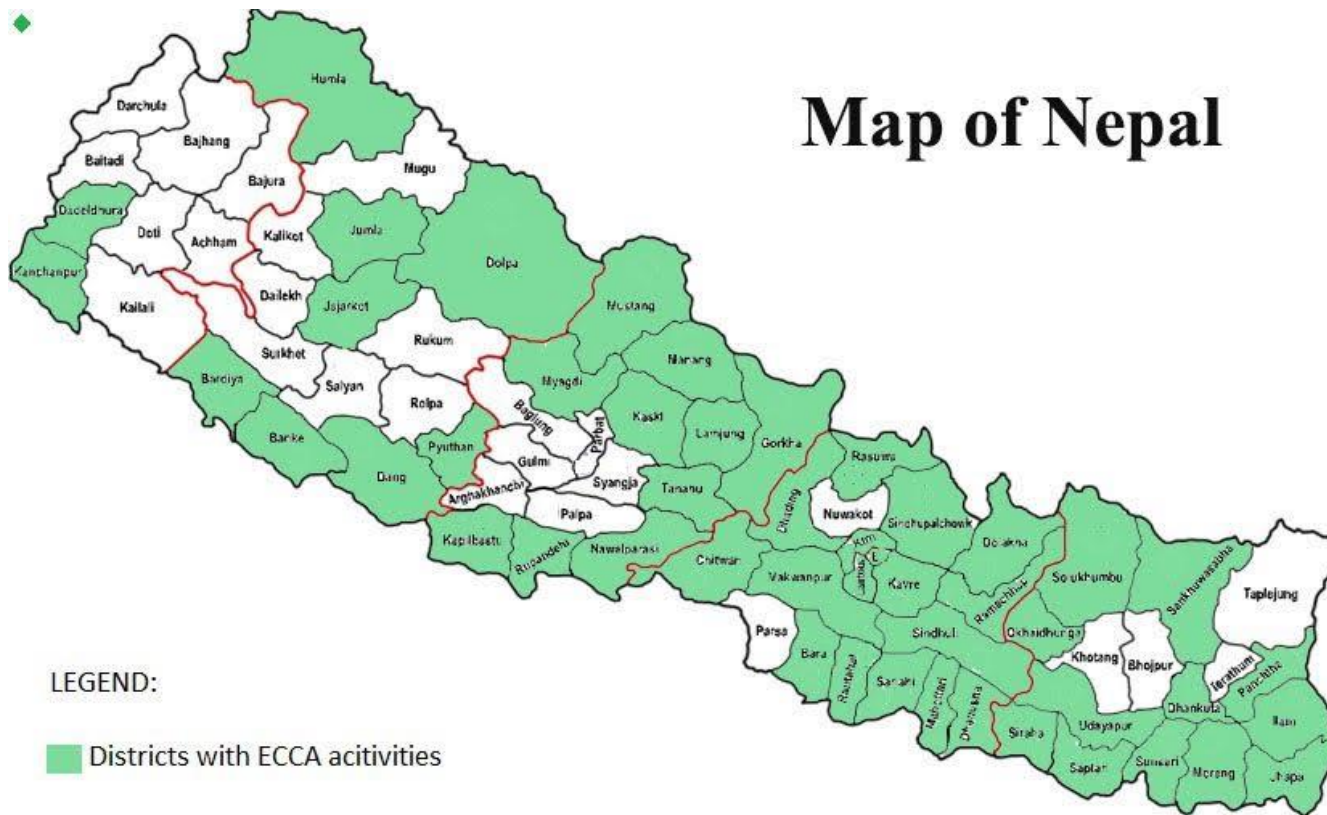
Map of Nepal