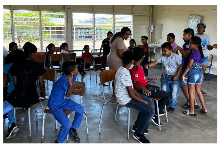
Figure 2 The migratory birds musical chairs game