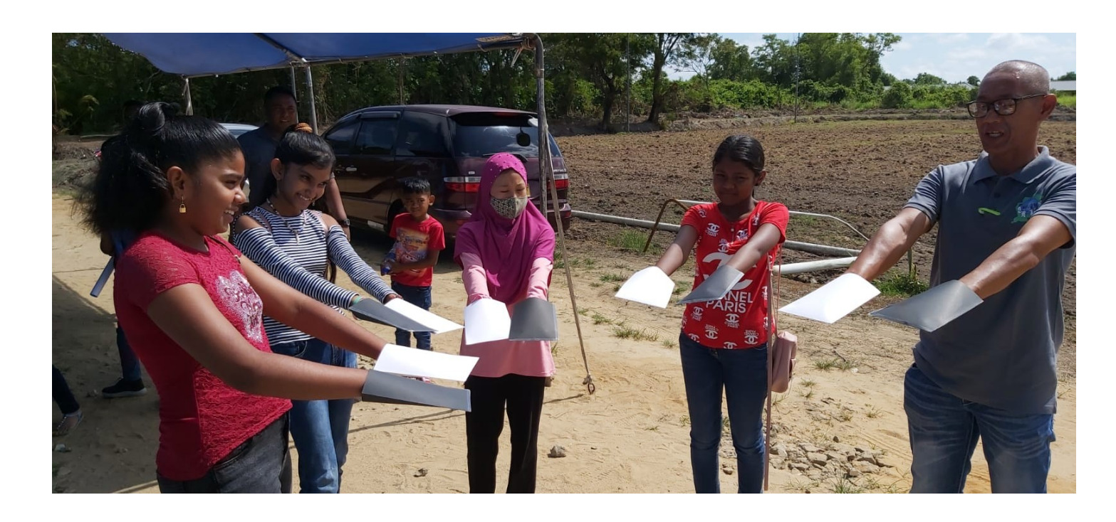
Teaching about Climate Science Principle 1 and how climate change is affecting migratory birds on migratory bird day