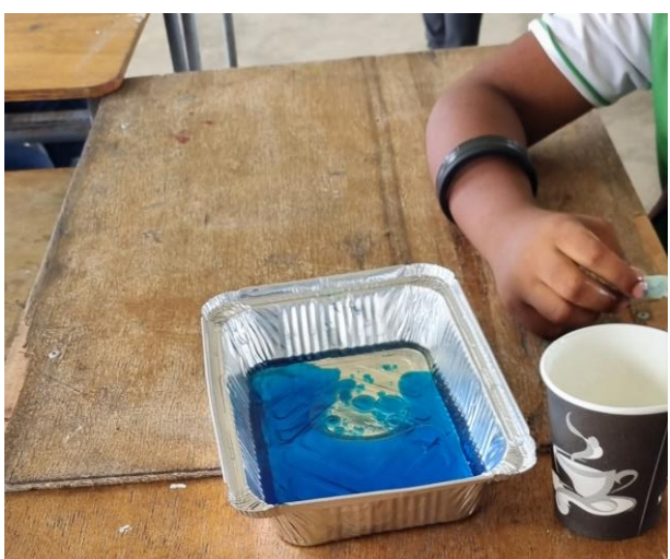
Figure 1 Oil spill experiment during vacation activities