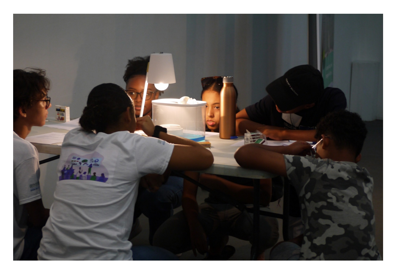
Youth from Interact group Brick-by-Brick teach other children about the water cycle and climate change.