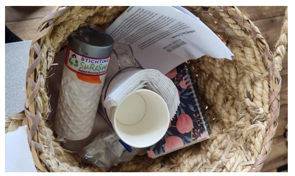
Figure 3 One of the activity boxes