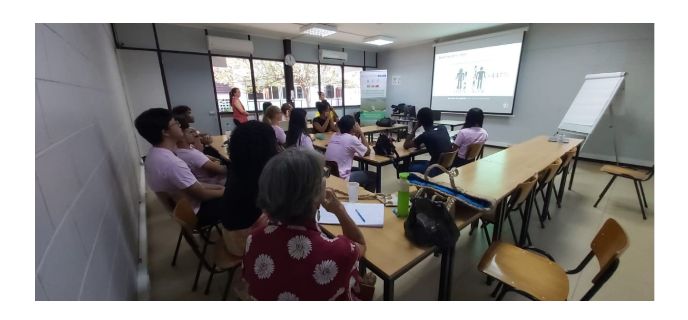
Training of a group of youth from Interact group Brick-by-Brick to learn how to teach other children about climate change