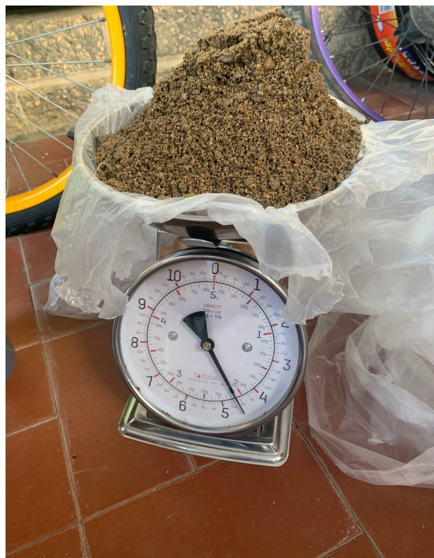
Figure 4. substituting fine aggregate