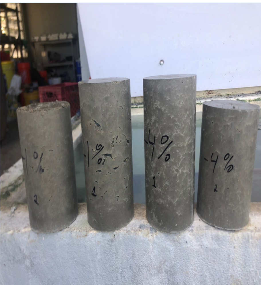
Figure 6. After curing time blocks