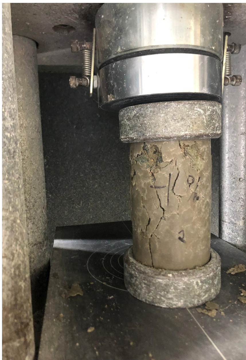
Figure 12. Testing the concrete sample