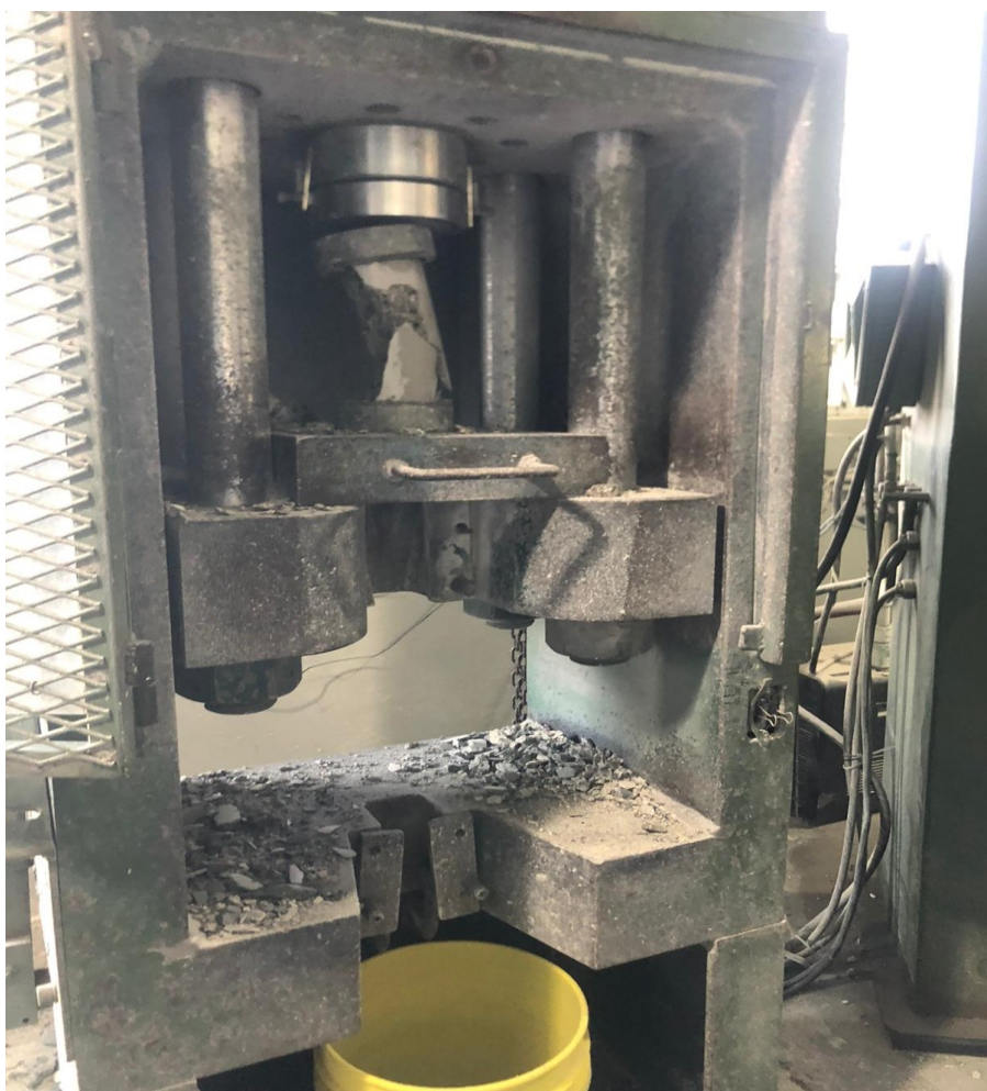
Figure 7. Testing the concrete