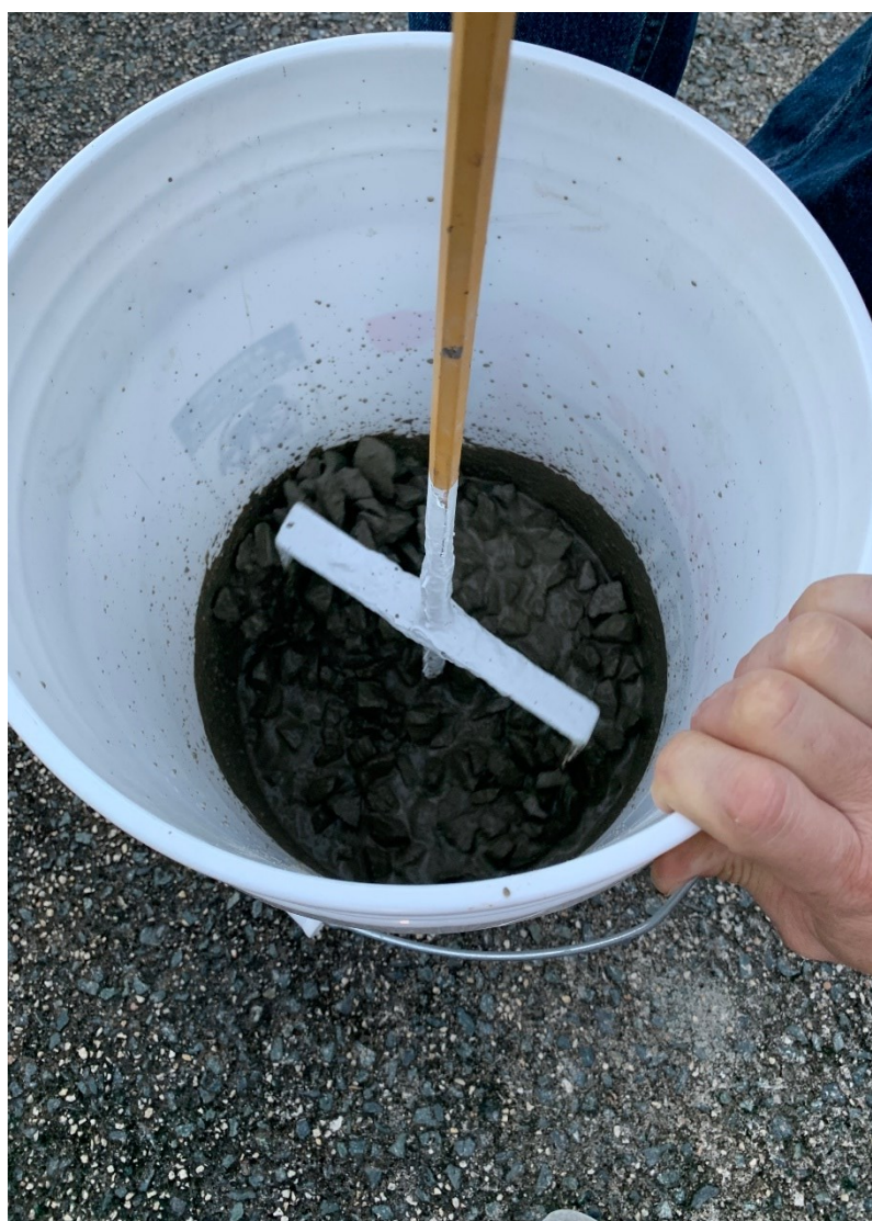
Figure 5. Concrete mix