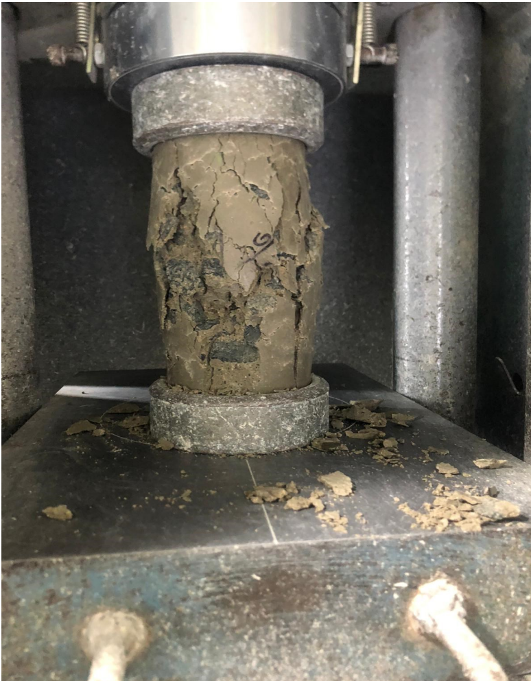
Figure 9. Testing the concrete