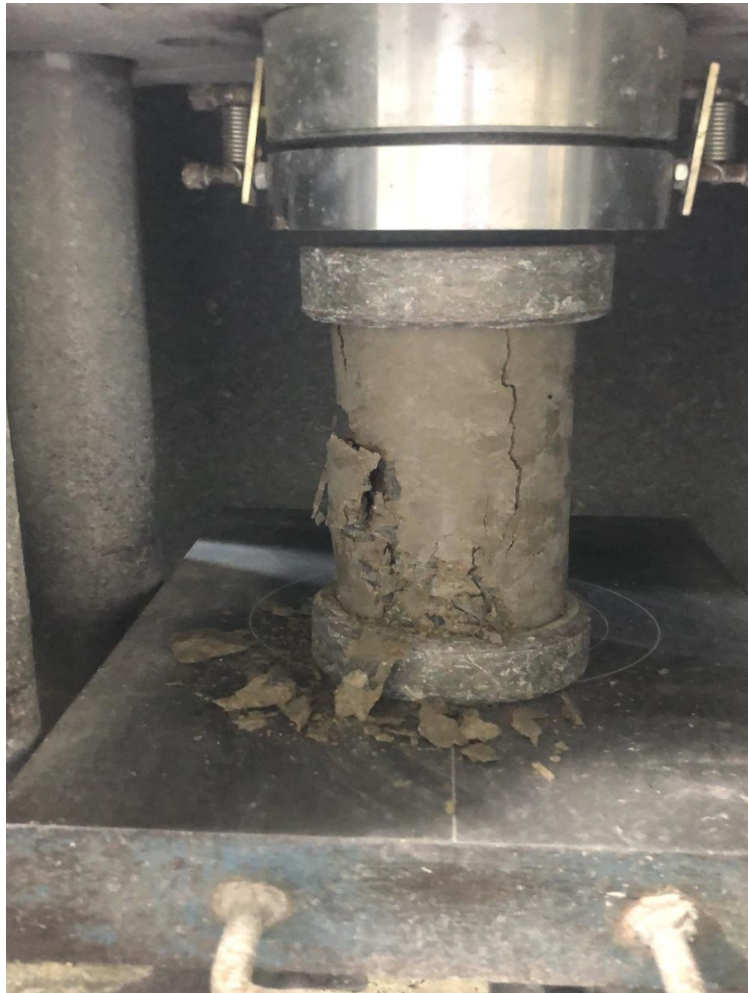
Figure 8. Testing the concrete