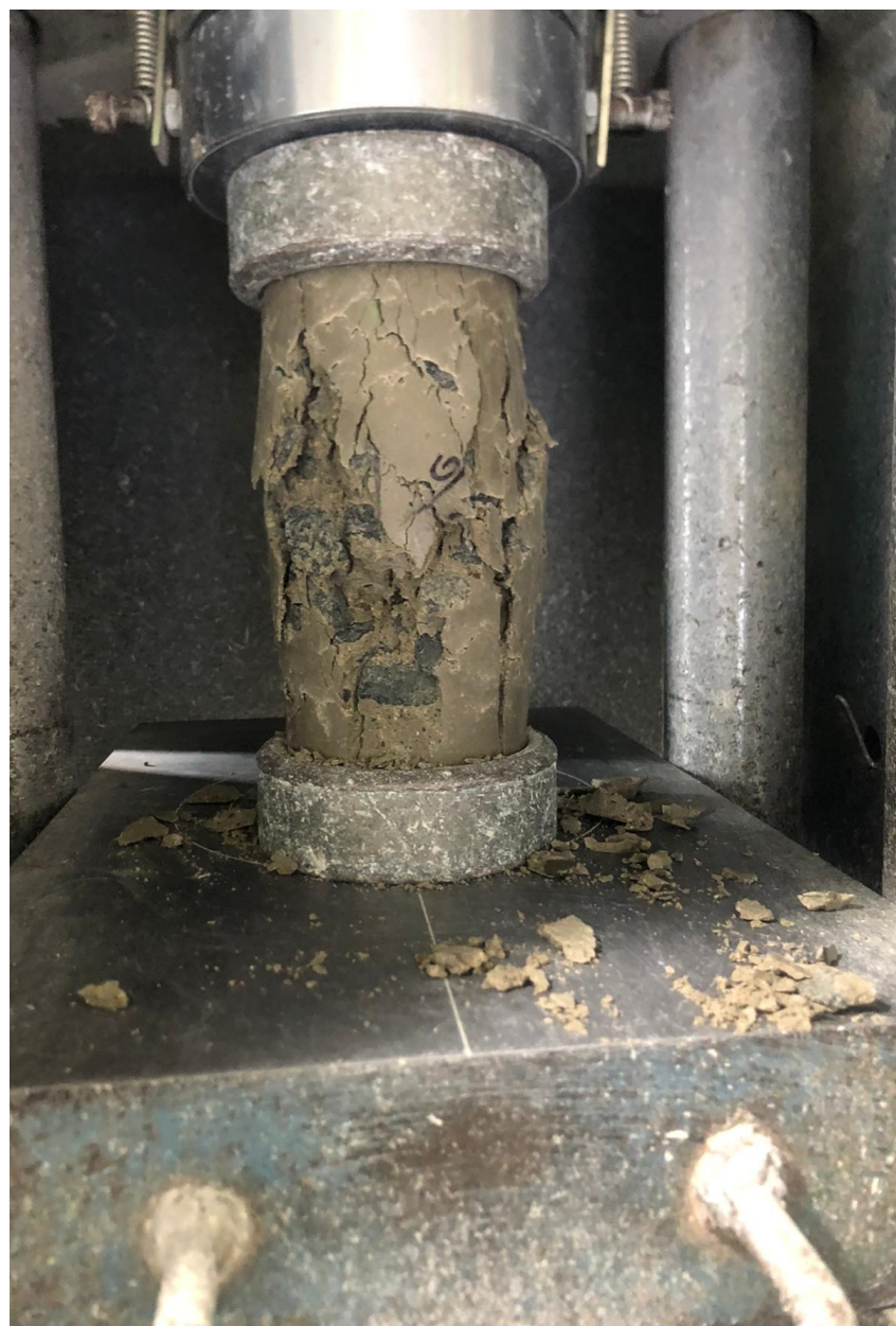
Figure 10. Testing the concrete sample