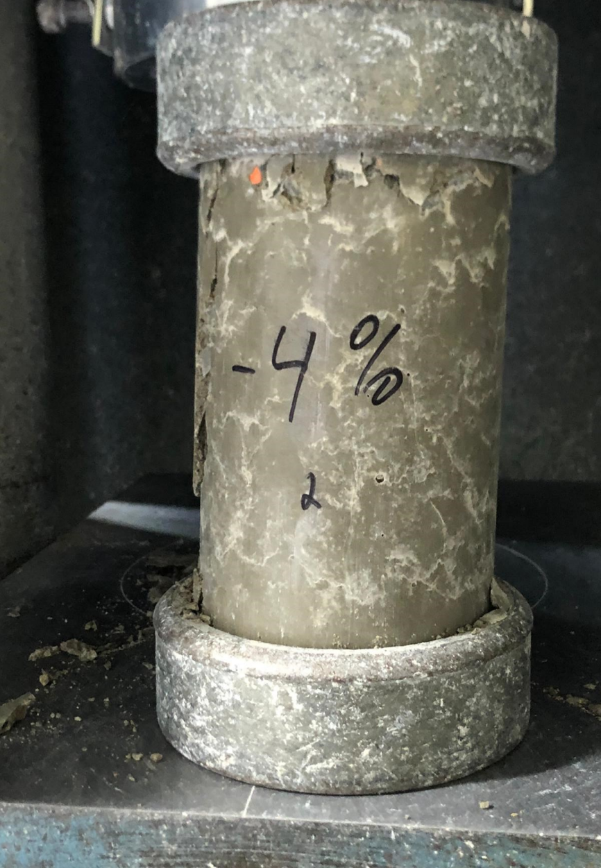
Figure 11. Testing the concrete sample