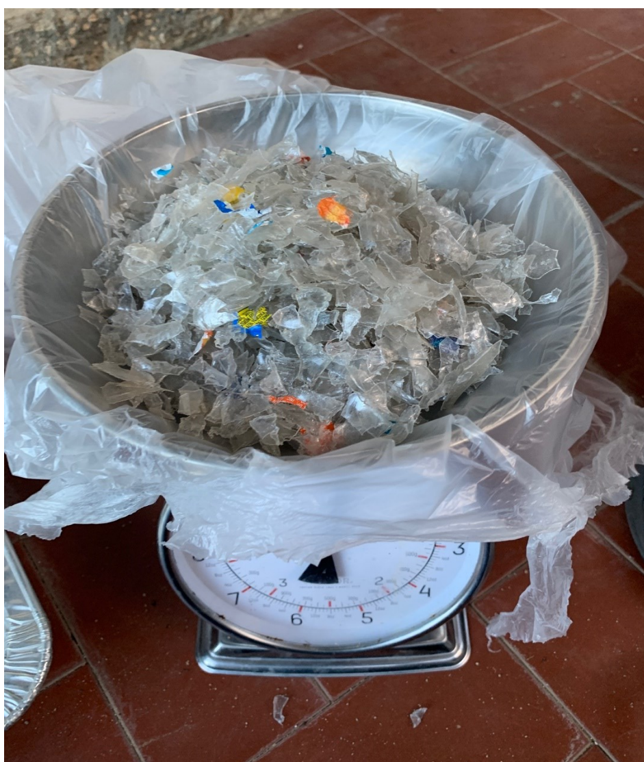
Figure 3. substituting fine aggregate