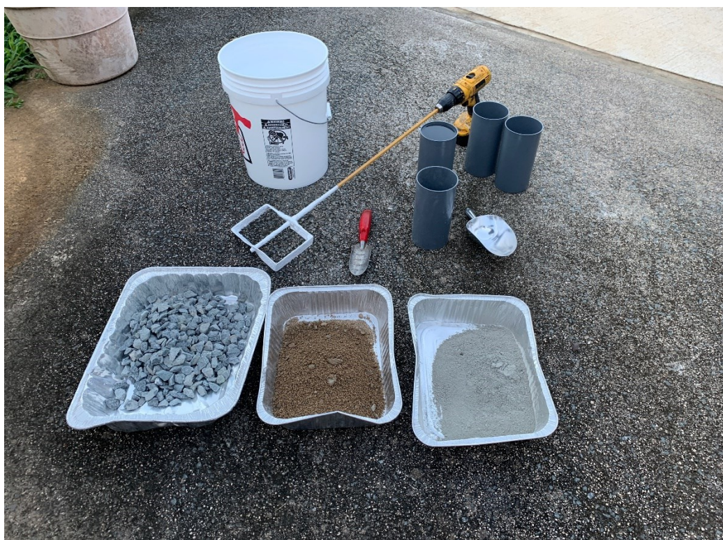
Figure 1. Materials