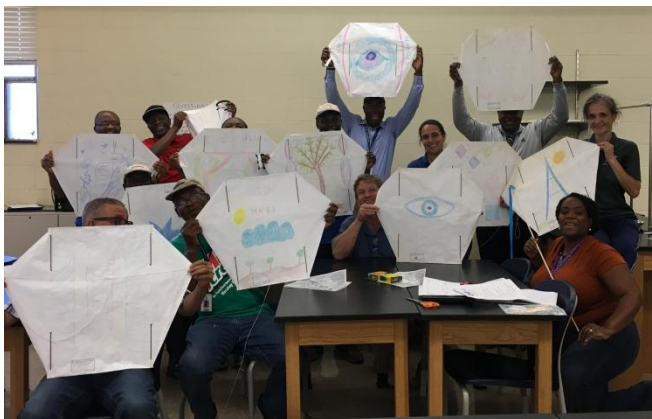
STEAM – All French Symbols