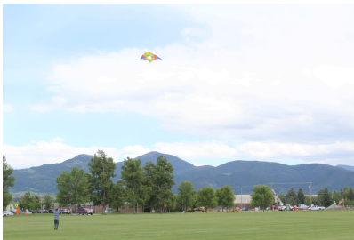
Kite Flying in Montana and an Anacostia River ROVER Mission