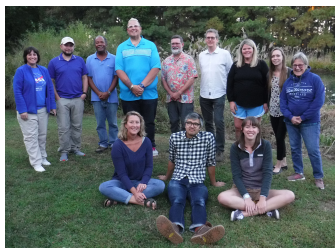
AREN Team Meeting