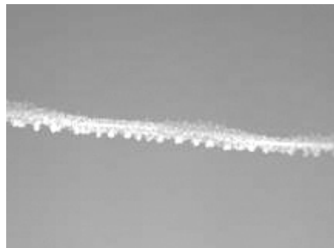
Figure 3. Persistent, spreading contrail

Because contrails are formed at high altitudes where the winds are usually very strong, they will move away from the area where they originated.