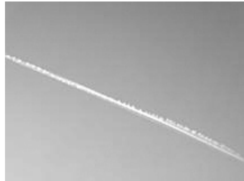
Figure 2. Persistent, non-spreading contrail