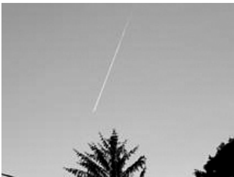
Figure 1. Short-lived contrail