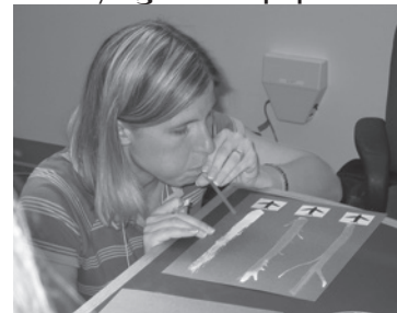
Figure 4: Making paint contrails on blue paper