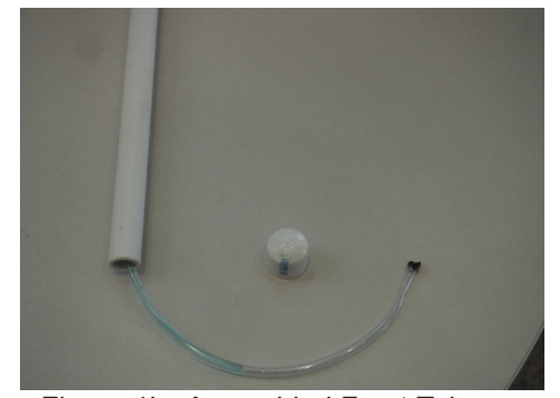
Figure 1b. Assembled Frost Tube

1. Estimate the below-ground length of the Frost Tube.