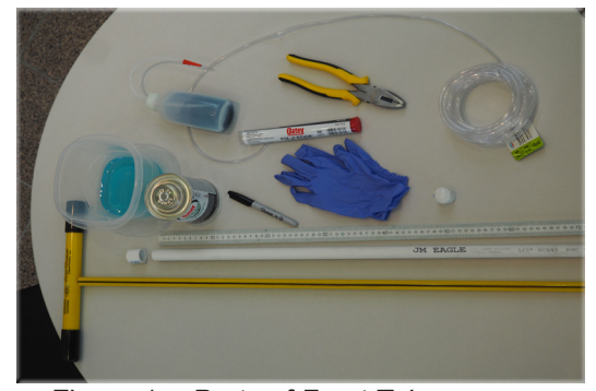
Figure 1a. Parts of Frost Tube