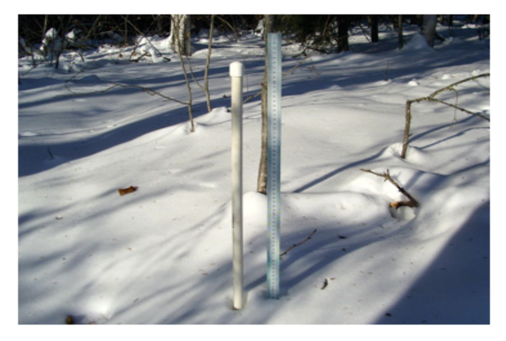
Figure 4. Assembled frost tube on left with a meter stick on the right