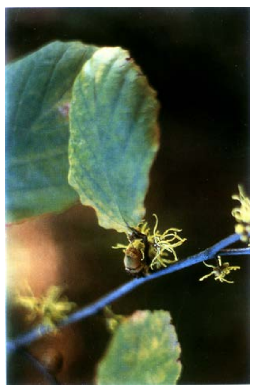
Witch-hazel (Hamamelis × intermedia) 'Jelena'