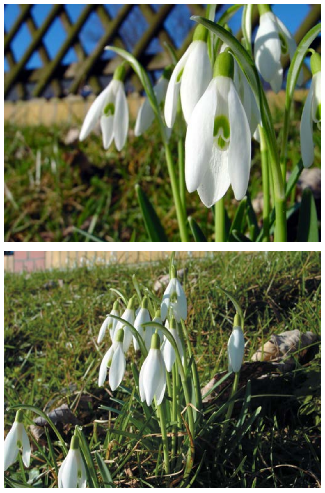
Snowdrops (Galanthus nivalis)