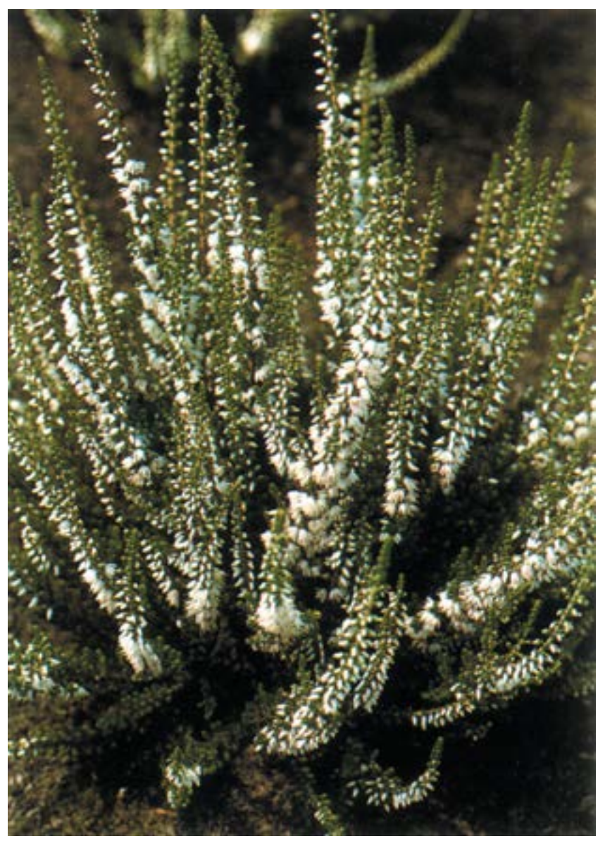
Heather (Calluna vulgaris) "Long White"