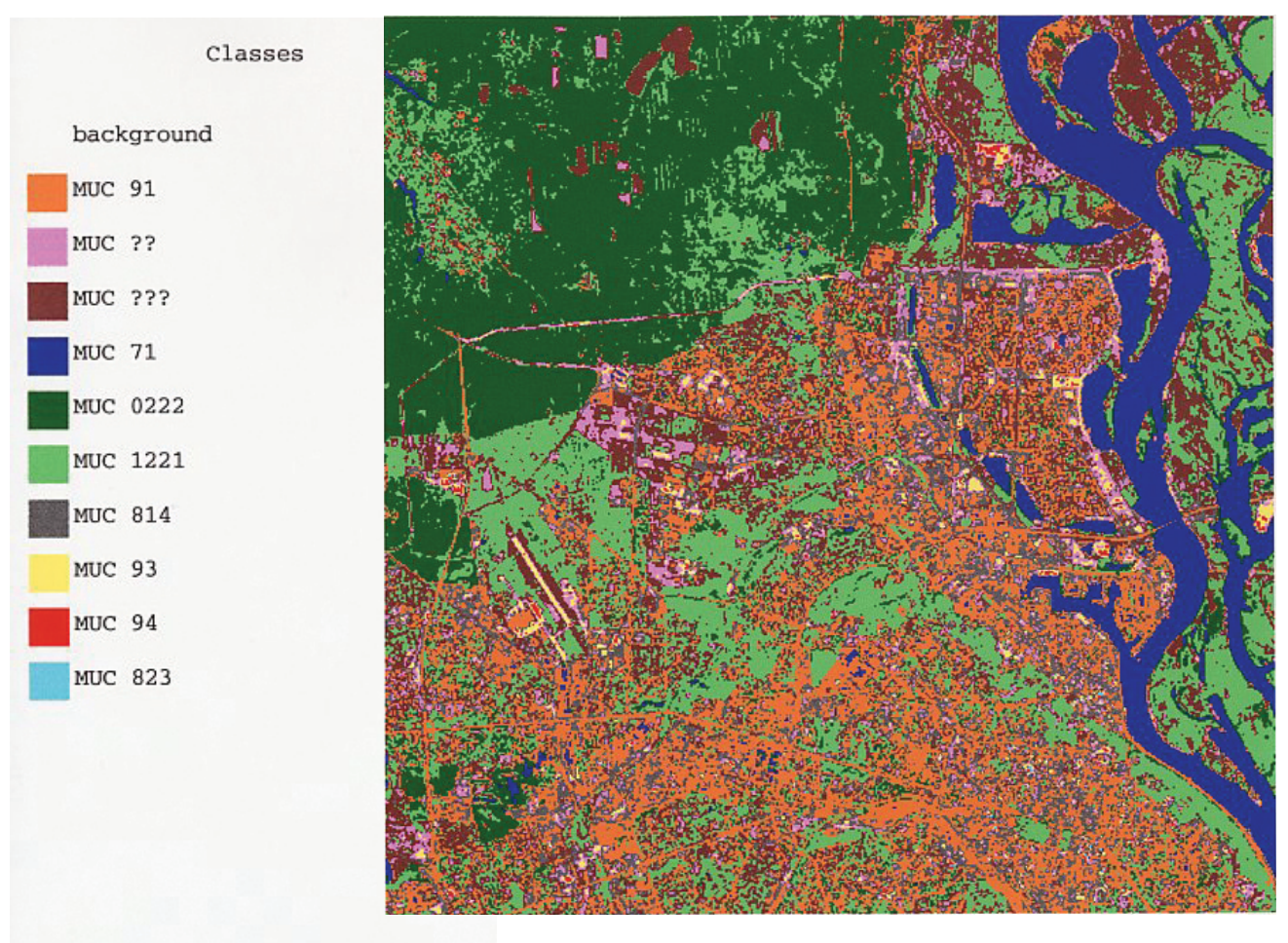
Figure LAND-UC-2: Unsupervised Clustered Land Cover Map of Kyiv, Ukraine with Two Unlabeled Classes