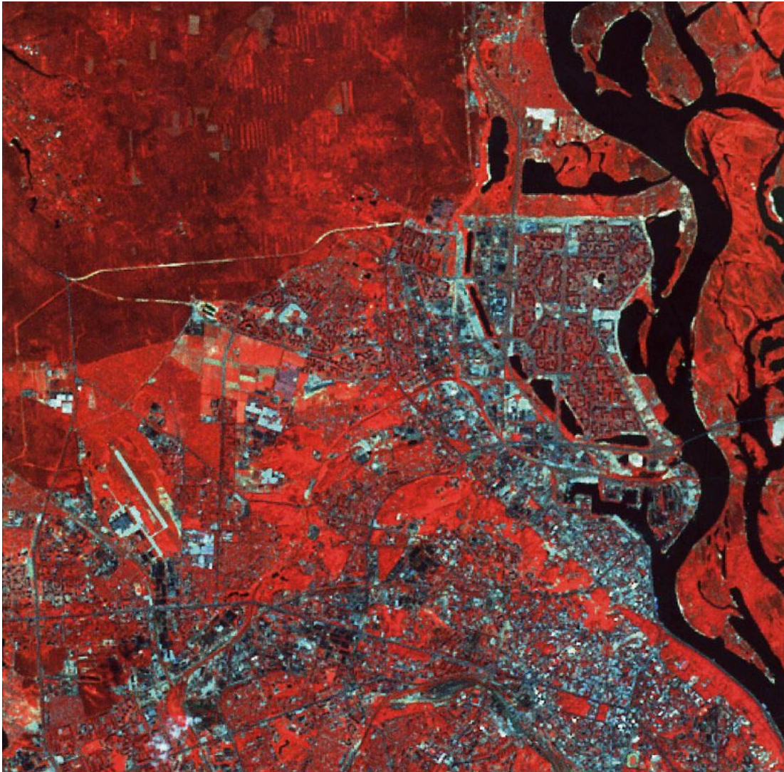
Figure LAND-UC-1: Kyiv, Ukraine 15 km x 15 km GLOBE Study Site