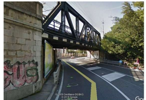
Cavalcavia ferroviario Railway overpass

By car , you have to use another gate, which is further, first street to left after the railway bridge.