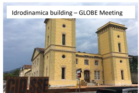
Idrodinamica building – GLOBE Meeting