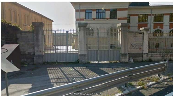
Cancello per pedoni Gate for pedestrians