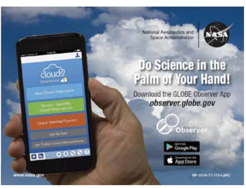
FIGURE 1 : Cloud reporting portion of the GLOBE Observer mobile app.

The GO app runs on any mobile device and is free at the Apple app store and Google Play. Note: current editions of the app do not work on Chrome books. An account is needed with an email address to record data within the GO app.