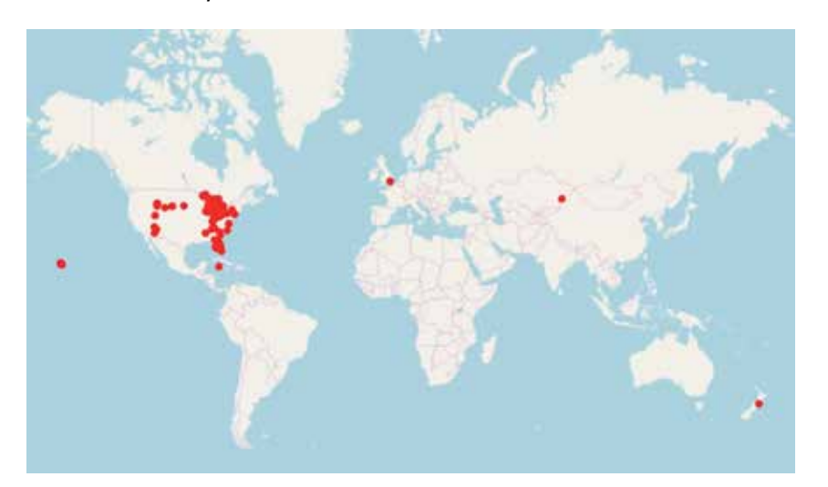
FIGURE 2 : Locations of GLOBE cloud measurements were submitted by Shumate Middle School students.

Remind students to never look directly at the Sun.