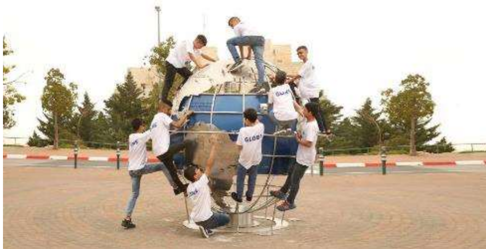
GLOBE DAY IN Essawiyeh Elementary School- Jerusalem . Israel.