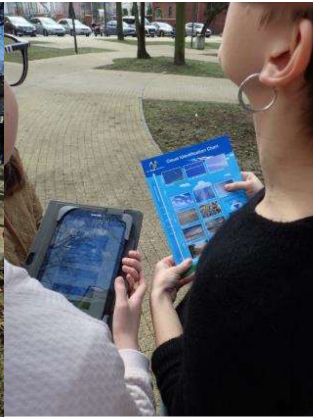
Students during cloud observation in the frame of GLOBE NASA Clouds: Spring Cloud Observations Data Challenge.