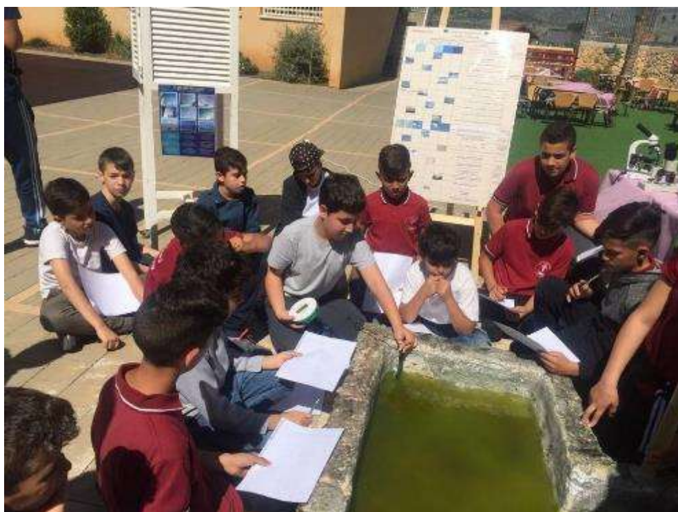
GLOBE Students in Der Hana C Elementary School . Der Hana , North Israel. Mosquito Protocol .