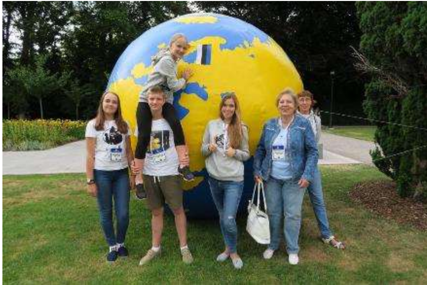
GLOBE Expedition – GLOBE Estonia summer camp (annual), in cooperation with scientists from different universities in Estonia (University of Tartu, University of Life Sciences in Estonia, Tallinn University), Jõulumäe, Estonia 13.-16. August