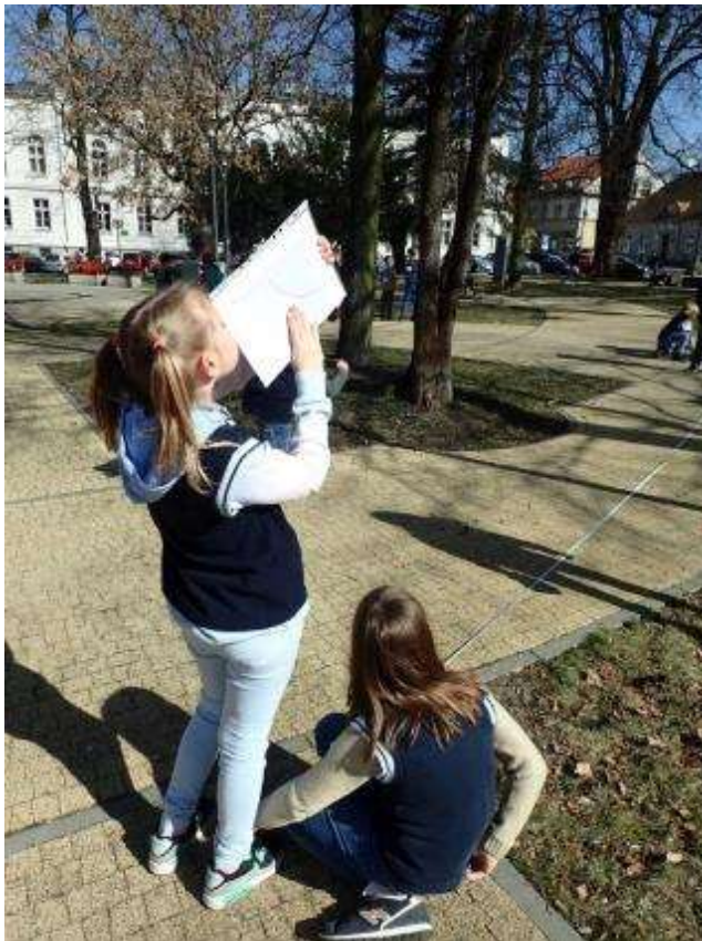
Students from Kwidzyn measuring tree height.